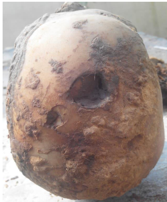
Fig. 4: Three mud-smeared depressed regions were noticed over the skull; two over frontal bone, in front of bregma and one over right parietal region.

During inspection of the skull, three depressed regions, two evident and one faintly visible, were noticed anterior to bregma and right parietal regions, respectively, and were covered with thick layers of mud (fig. 4).