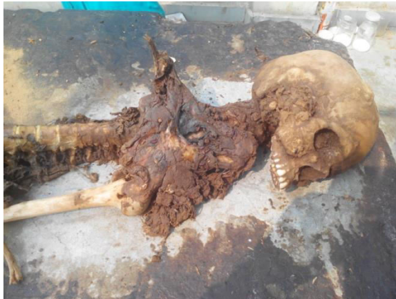
Fig. 2: Upper half of the body was largely skeletonized and smeared with thick layers of mud.

The upper half of the body was largely skeletonized and smeared with thick layers of mud at places (fig. 2). The lower limbs were clad in dirty bluish pants with hooks and zip tied and intact in situ and a black leather strapped belt with a white metallic buckle (fig. 3). Soft tissues and viscera were