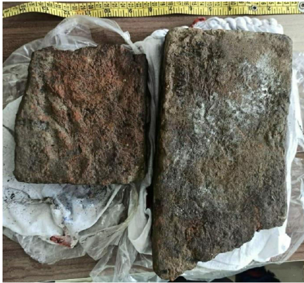
Fig. 9: Alleged weapons (bricks) brought for forensic medical examination and opinion to correlate with the injuries and death.

victim did not submit to their arguments and the perpetrators tried to snatch money from him. In this heated atmosphere