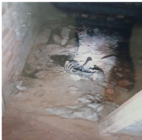
Fig. 1: Crime Scene Photograph: Skeletonized Male body within the dark room of a ruined building (night view). The floor of the room is cluttered with bricks, plastic bottles, garbage and other construction material.

According to the police information, a telephonic message was received at the police control room in nearly midnight from some unknown source, regarding a human skeleton lying within an under-construction building on a highway, at a dubious location. The building's owner (traced later) denied of any construction work in the same from nearly past two years. The police reached the spot within an hour or so and inspected the building which was almost in ruins, lacking any electricity. On continued search with the torch-light, the police noticed a skeletal mass lying within a small dark room, devoid of any gate or windows (fig. 1).