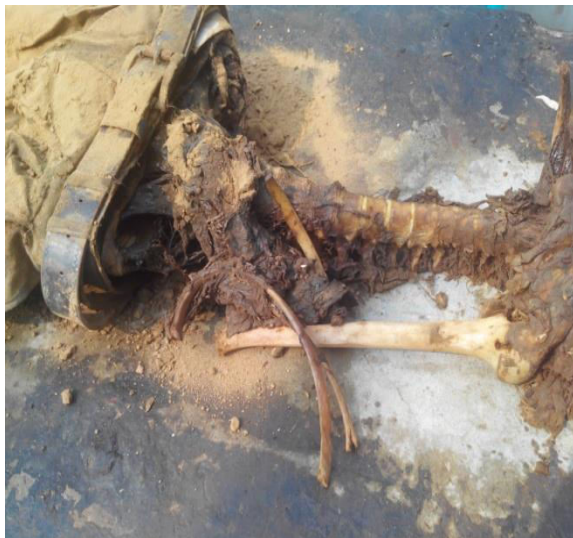
Fig. 3: Lower trunk and pelvic region with mud stained clothing and exposed bones. Evidence of animal scavenging is present over distal epiphysis of humerus and costal ends of lower ribs (upper rib showing postmortem breakage).

largely missing from the upper half of the body, except for a jumbled up mass of putrefied soft tissues around right scapula and shoulder girdle. Animal scavenging was evident over distal epiphysis of right humerus while costal end of a left rib depicted linear breakage and slight splintering extending from the gnawed margins (postmortem in origin). Feeding and puncture marks of scavengers were also evident over distal shafts of both bones of legs near ankles, and over left scapula.