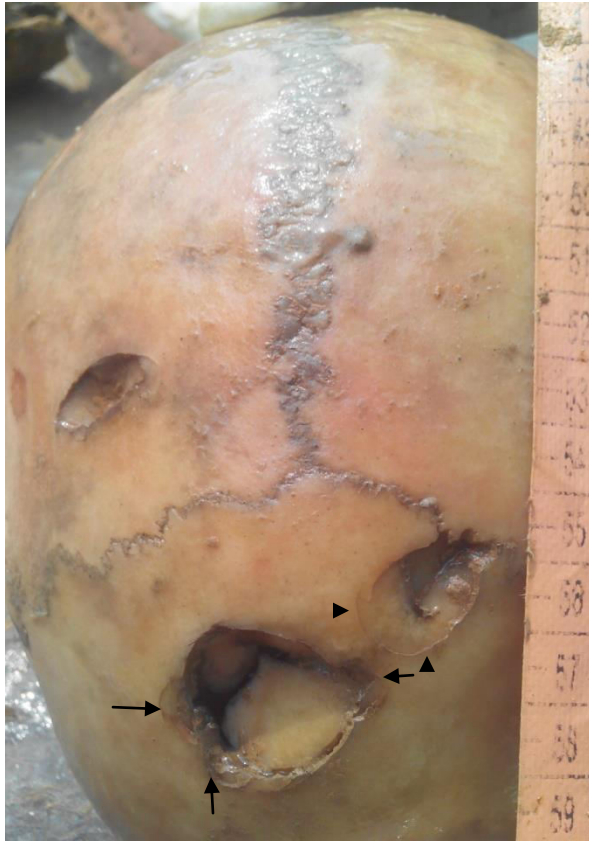
Fig. 5: Skull after cleaning: Three depressed fractures are clearly visible in the regions corresponding to fig. 4. All the fractures are located above hat brim line. One dent (impression) was present over right-lateral midparietal region (not visible here). Terracing is visible over fracture's margins from compression of bone plates (black arrows). Wedge-shaped bone plates are going in. Hoop fractures are visible (arrow head).

The skull and the rest of the muddy body were thoroughly washed and cleaned under gentle stream of water. The examination of skull leads to an unremarkable disclosure. Three DSFs and a dent, of varied sizes albeit similar features, were present near the vertex region of skull (fig. 5), as follow: