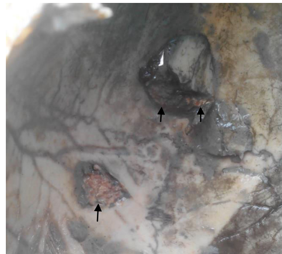
Fig. 6: Inner table showing pyramid shaped bone fragments with jagged tips, directed deep into the cranial cavity. Cortex has been delaminated in some regions (black arrows) exposing skull diploë. Inner table beveling is present within circular fractures

Significant crushing of the margins was well appreciable. Wedge-shaped plates of bones, resulting from secondary and tertiary fractures from the central depressed point (of max. impact), were directed within cranial cavity. A linear fracture was radiating from the lateral margin, near a V-shaped area. Inner table of the skull was fractured and depressed in a similar fashion, measuring 7 mm in depth from endocranial surface to the centre, and flaking with exposure of diploë (fig. 6). The fractured tips were acutely jagged. Inner table beveling was present along circular margins.